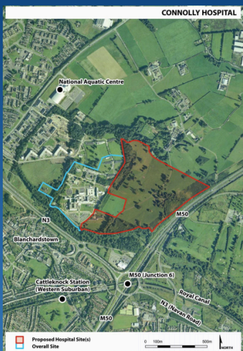
Connolly Hospital, Blanchardstown

Proposed maternity hospital unlikely to be built due to the lack of space or parking.