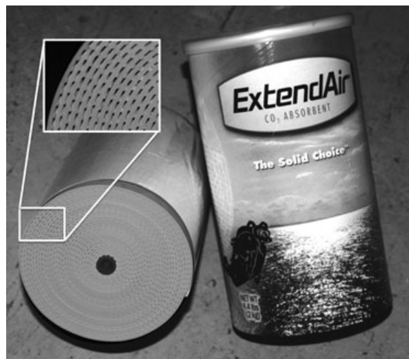
Figure 3 The Solid State ExtendAir™ calcium hydroxide CO 2 absorber. The inset shows the castellation channels incorporated to aid the flow of gas through the absorber.

A plastic housing made from Delrin (DuPont, Wilmington, DE, USA) was used to hold a non-granular ExtendAir™ CO 2 absorber (Micropore Inc., Newark, DE, USA) containing 2 kg of calcium hydroxide (CaOH) (Fig. 3). Two bespoke T-shaped connectors (CRDM Silicone sealed SLS Nylon-12) were used to connect the 35-mm inspiratory and